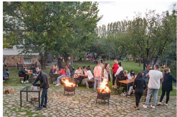
Barbecue on Campus

The choice to trust first is a bold reaction to erosion of trust in the world. People who grow up in societies where truth is devalued, like Albania under communism, learn to approach new relationships skeptically. Today, even in prosperous democracies, social media is cynically used by politicians, businesses, and other influencers to corrode trust between people. For young people who are still learning who they are in this world, it can be hard to know whom or what to believe in. Rather than criticizing young people for their ways ("Older people have always criticized the new generation, for hundreds of years," Mr. Geiger observes), why not start by offering them trust and respect?