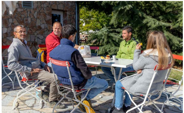
Colleagues from different lines of work meet at Café L'Aurore on the NG Campus in Buçimas