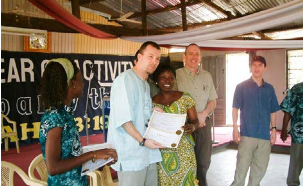
Global Business Assist to Ghana