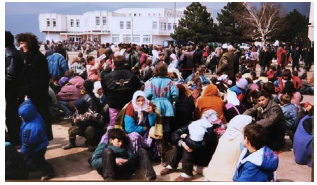
Kosovar refugees 1999

Albania. AEP was packed away in boxes and put into storage until it was safe to come back. The board of AEP invited us to reopen the project and welcome the missionaries back. We moved to Tirana with our children, then four and two years old. The office was just down the street from our home. You'd still hear gunfire on the streets at night but things were beginning to stabilize.