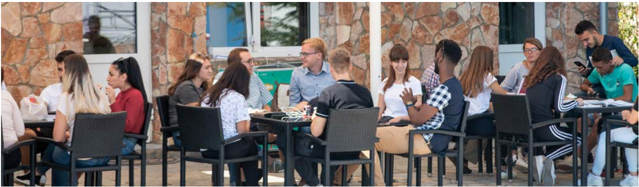
Cafe L'Aurore, a popular meeting place also for students and pupils.