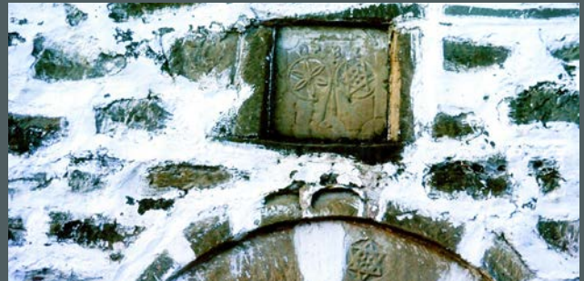
Stars of David decorate a front door in Korça in the 80's

After Germany occupied Albania in 1943, the people of Albania, in an extraordinary act, refused to obey and to hand over to the occupiers lists naming the Jews living among them. Also, various state institutions provided Jewish families with forged papers, so they could mingle with the local population. The Albanians not only protected their own Jewish citizens, but also provided refuge to those who had come to Albania while it was still under Italian rule and who now lived in constant danger of being deported to concentration camps.