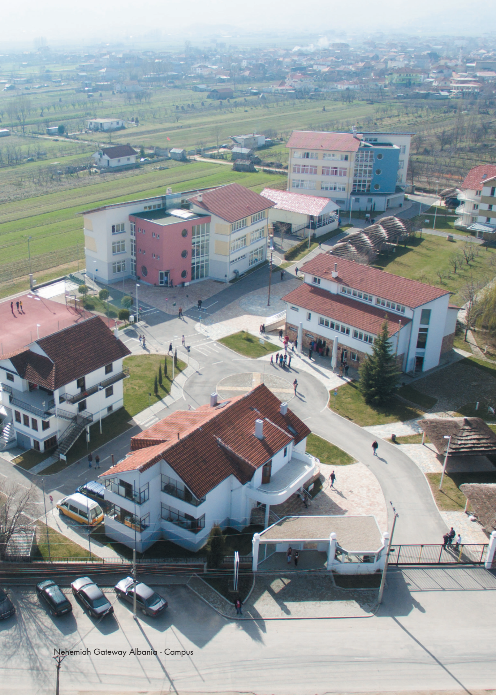
Nehemiah Gateway Albania - Campus