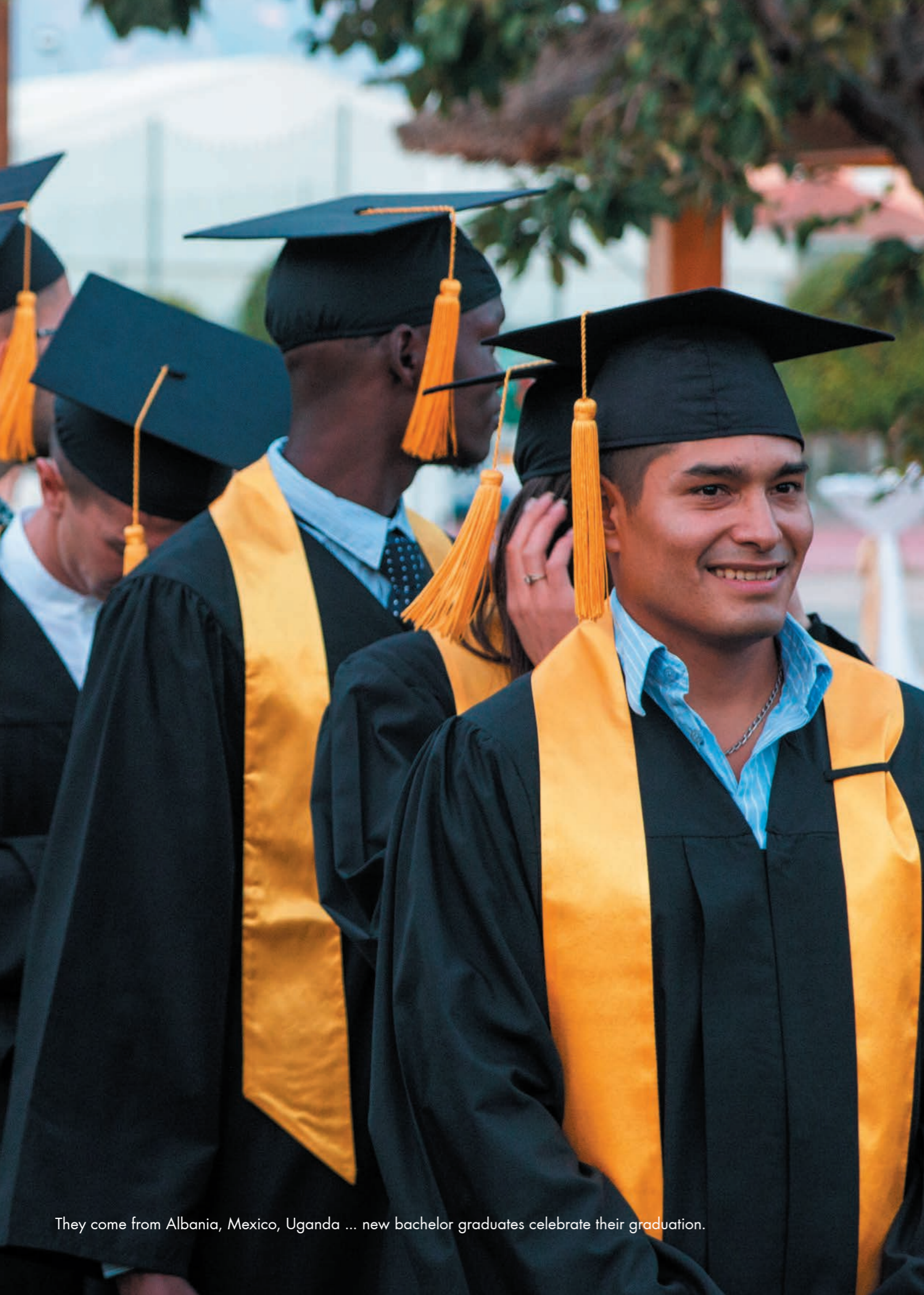
They come from Albania, Mexico, Uganda ... new bachelor graduates celebrate their graduation.