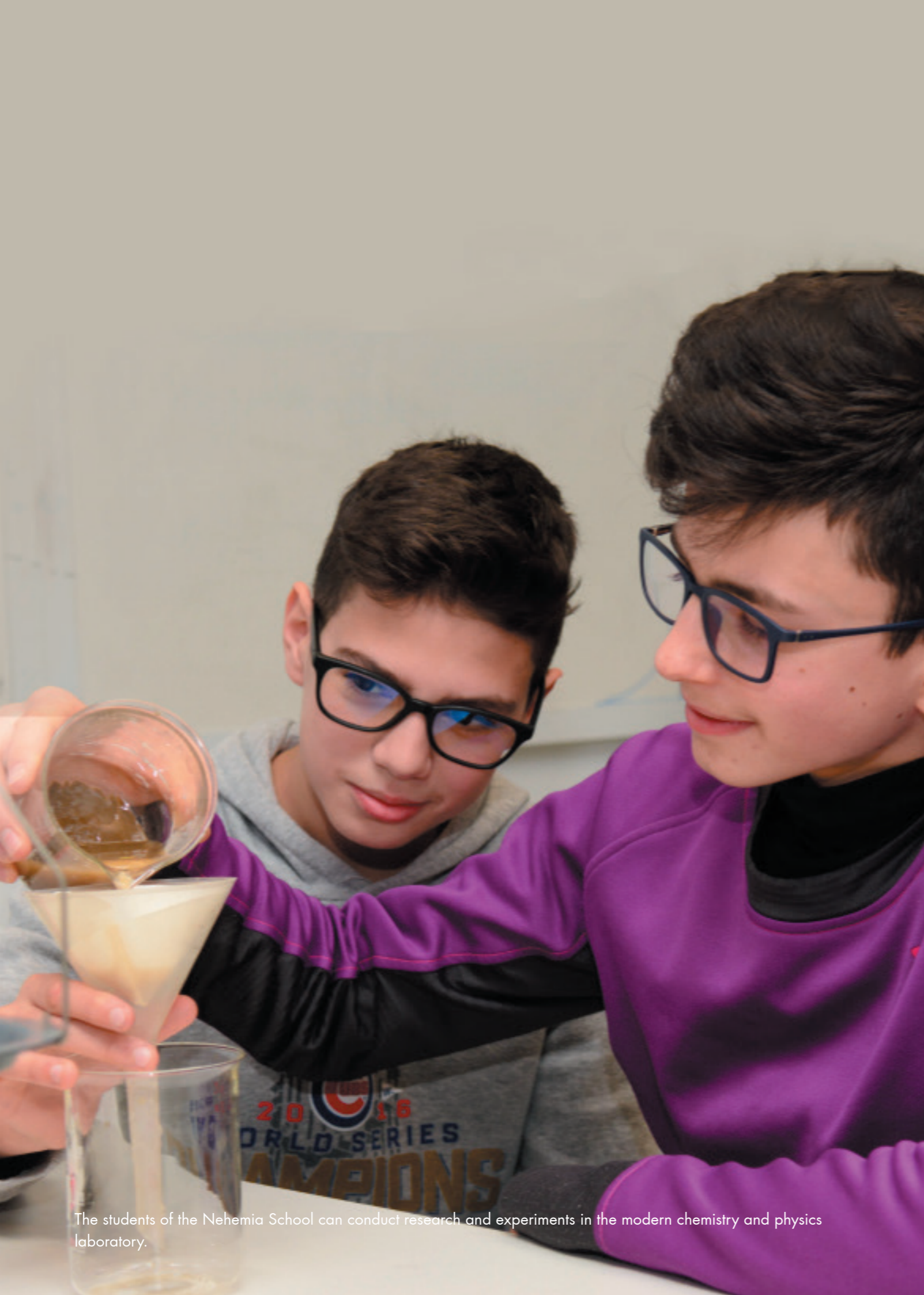
The students of the Nehemia School can conduct research and experiments in the modern chemistry and physics laboratory.