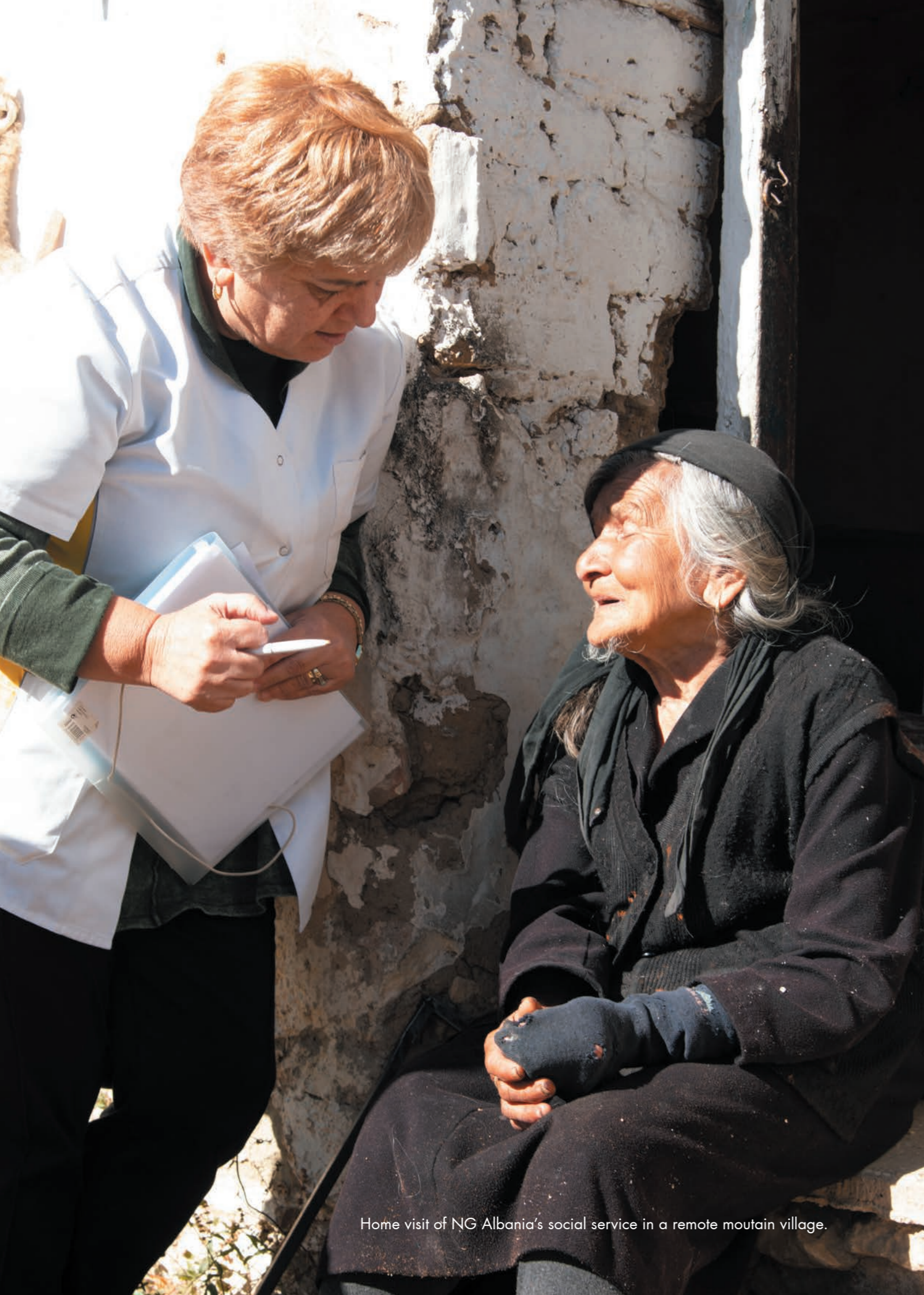
Home visit of NG Albania's social service in a remote mountain village.