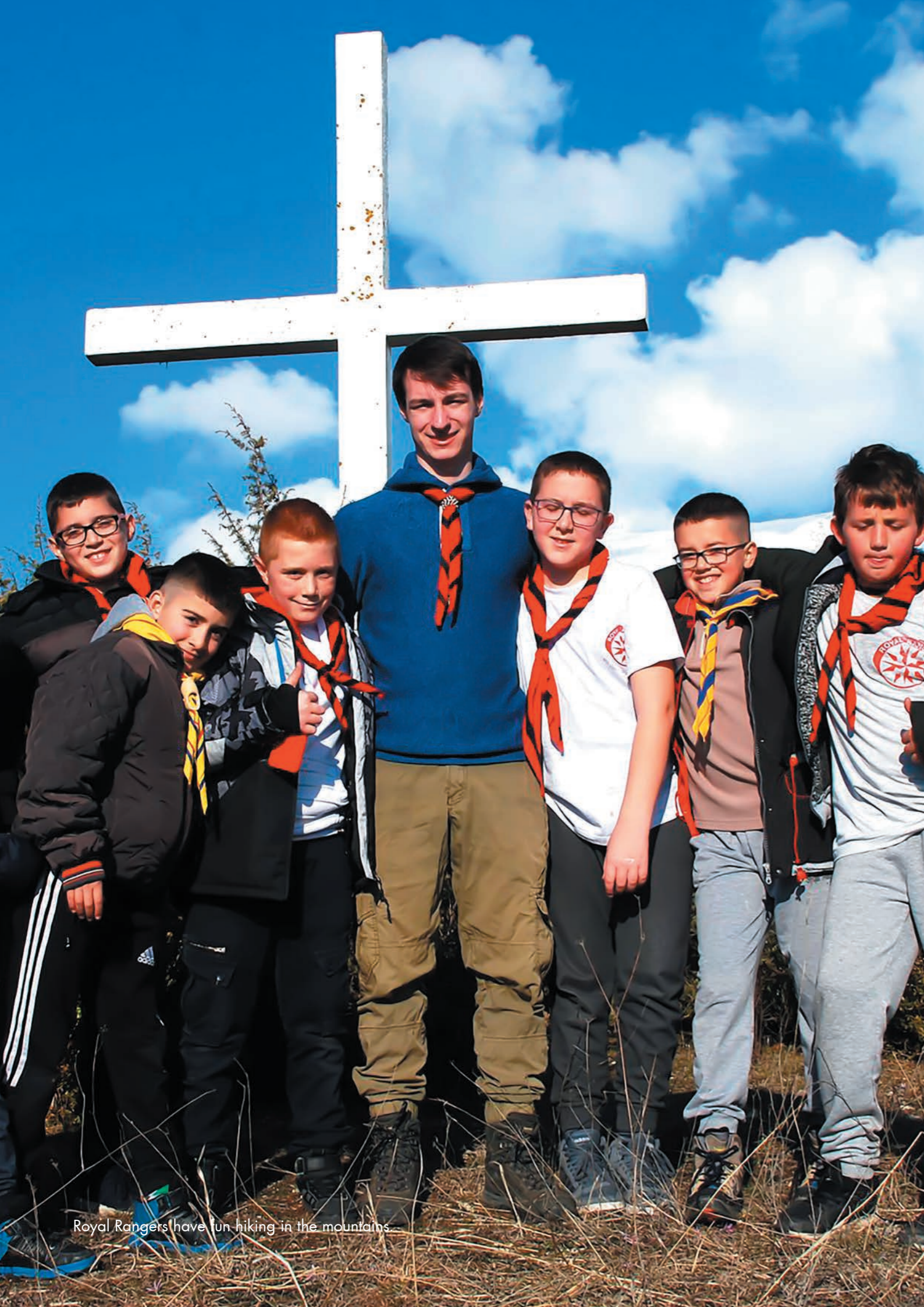
Royal Rangers have fun hiking in the mountains.