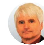
Johannes Selle, Member of the German Parliament