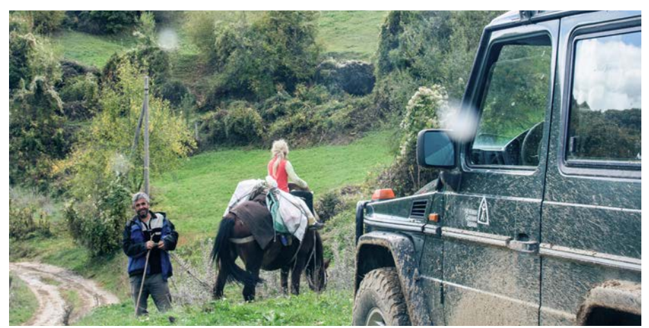
When the off-road vehicle can't get any further, villagers have to fall back on their trusty mules